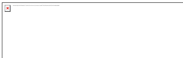
Figure 6. Registry Editor On Windows XP.

The registry file editor in Figure 4 has been modified as depicted in Figure 5. When user enters the name of Honeypot, for example, 'SERVER', it replaces the computer name. The produced batch file runs the code and it changes the value of Active Computer Name REG_SZ as stated in the Registry Editor as shown in Figure 6.